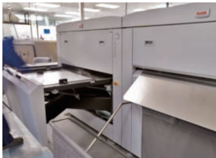
King Printing Co., Inc. is a value-added services provider that operates a KODAK MAGNUS 800 Platesetter and other new technologies that increase efficiency. KODAK Unified Workflow Solutions enable King Printing to operate streamlined digital and traditional print environments.

King Printing has achieved what many graphic communications firms aim to accomplish—becoming a value-added services provider. A